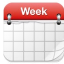
Agenda at a Glance